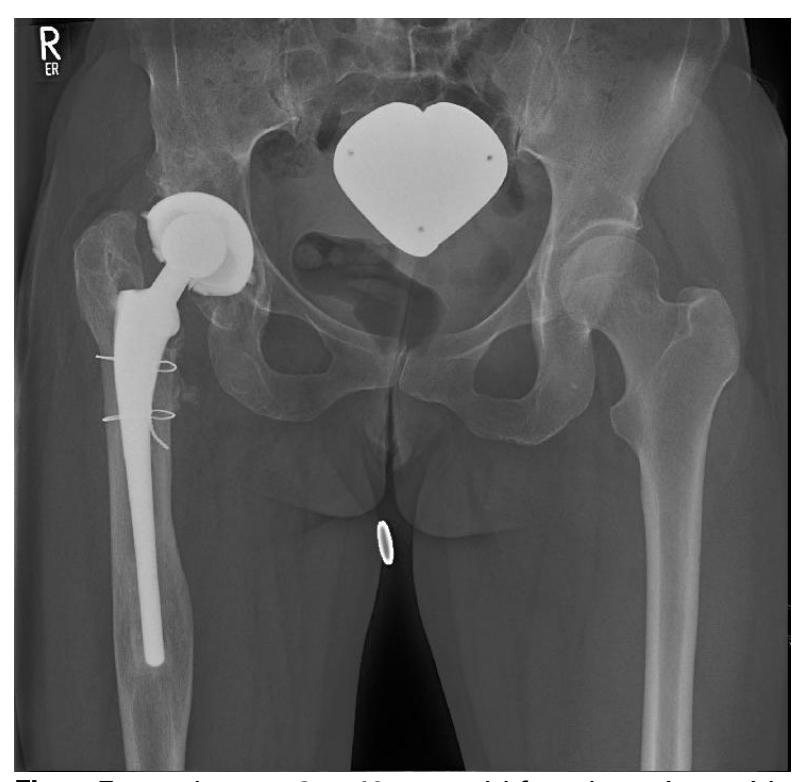
Fig a. Example case 3: a 49-year-old female patient with an aseptic cup loosening and suspected iliac osteolysis.