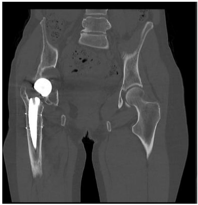
Fig b. Example case 3: CT scan showing a massive osteolysis due to extensive polyethylene wear.