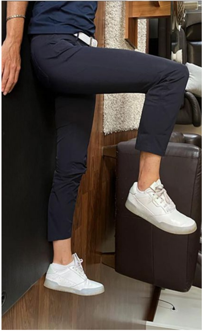
Fig d. Example case 3: clinical outcome at three-year follow-up.