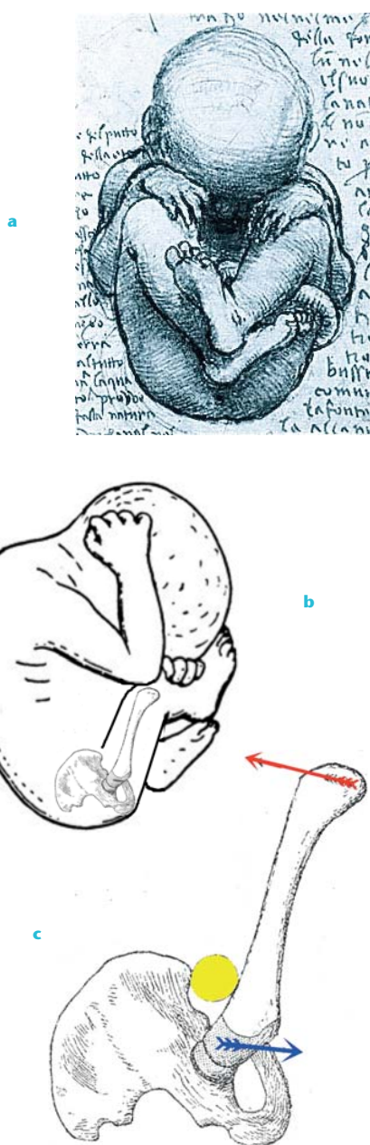
Fig. 3 – Leonardo da Vinci's depiction (a & b) of the "position pénible" and c) the levering of the femur against the anterosuperior iliac spine. The yellow ball depicts interposed soft tissue and the red arrow depicts pressure from the uterine wall. The blue arrow shows the torsional moment that may increase anteversion while the femoral head is levered out of the acetabulum (modified from Le Damany, P. La Luxation Congenitale de la Hanche . Paris: Masson, 1923. 16 )

For DDH, the uterus represents a unique, largely constant mechanical environment. Yet